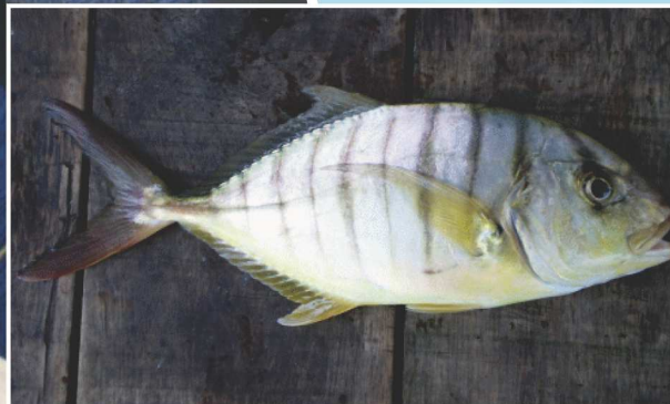
Golden Trevally 文兰

The Barramundi ( Lates calcarifer ), also known as Asian Seabass, is a species of catadromous fish in family Latidae of order Perciformes.