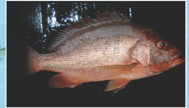
Red Snapper 红鸡

The golden trevally ( Gnathanodon speciosus ) is a tropical marine fish in the jack family (Carangidae).